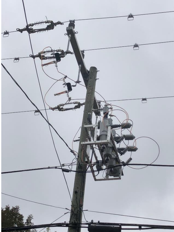
The hardware used to create the Project SPEEDIER microgrid area.